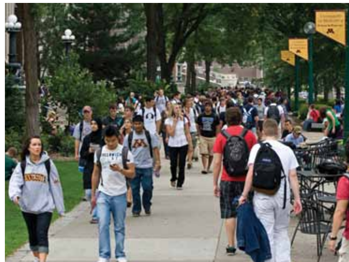
Students on Northrop Mall, East Bank campus of the University of Minnesota