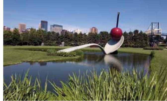
Walker Art Museum's Sculpture Garden, Minneapolis

The Minneapolis-St. Paul area, collectively known as the Twin Cities, is renowned for its cultural and recreational opportunities and beautiful natural surroundings.