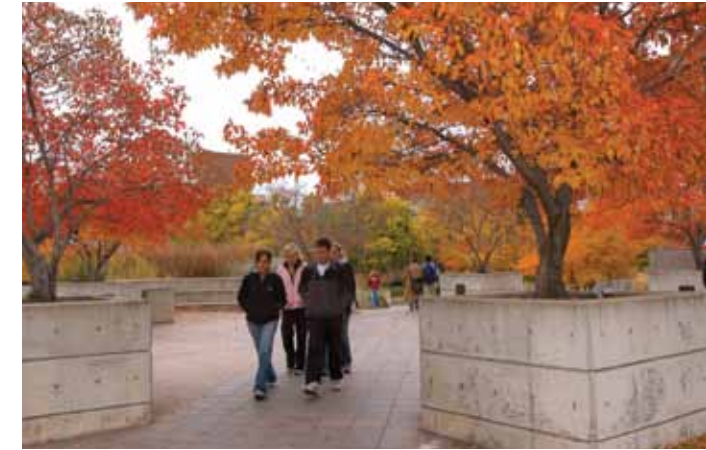
Fall colors behind Northrop Auditorium

How long you study English before starting an academic program depends on your level of English. Some students study English for a year or more; some study for one term.